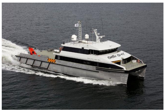
The MV Outer Limit

EOG has issued advice about the survey to the Australian Hydrographic Office to enable the Notice to Mariners to include the survey details. The vessel will be towing equipment approximately 100 m behind the vessel and EOG kindly requests other vessels to maintain a 500 m separation from the MV Outer Limit while it is undertaking survey operations.